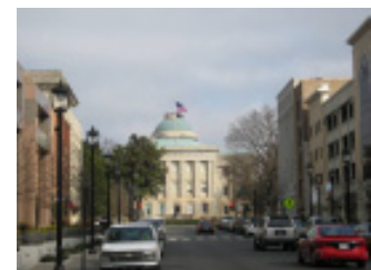
View of the State Capitol in front of our office.